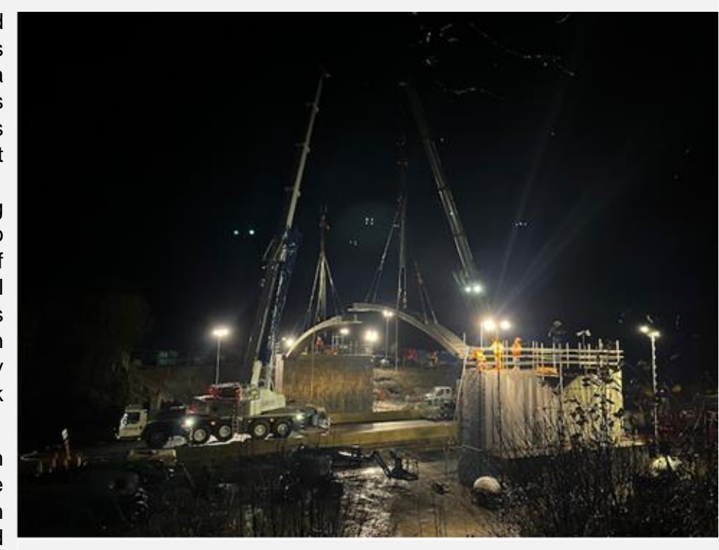
West Buckland Bridge - Bebo Arch Lift.